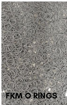
FKM O RINGS