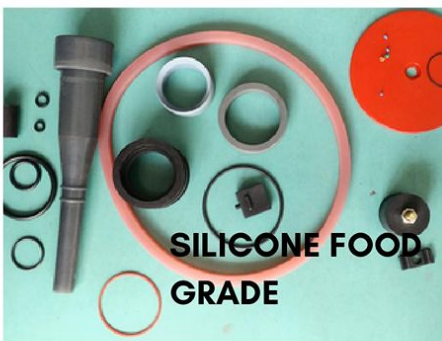
SILIGONE FOOD GRADE