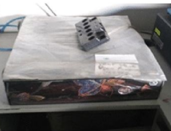
VENT VALVE OP/CL PR. TESTER